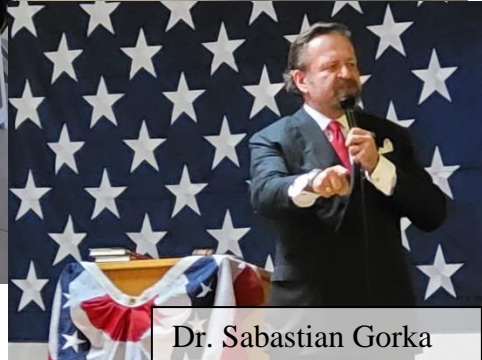
Dr. Sabastian Gorka