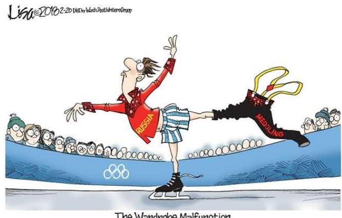
The Wardrobe Malfunction