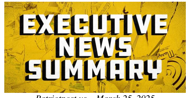
Patriotpost.us – March 25, 2025