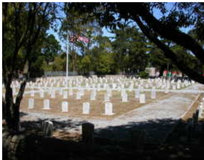
Presidio of Monterey Cemetery, Monterey