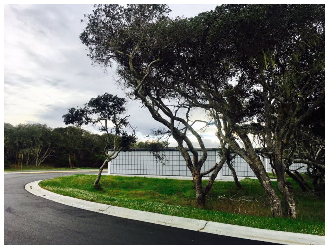
Central Coast Veterans Cemetery, Seaside

To honor our fallen heroes at the Presidio of Monterey Cemetery and the Central Coast Veterans Cemetery in Seaside, we are collecting donations for Wreaths Across America, which lays live wreaths at veteran cemeteries across the country. To participate you can bring cash or a check payable to "Wreaths Across America" to our November luncheon or mail your check to our post office box 223723, Carmel, CA 93922. Wreaths are purchased in increments of $15. For example one wreath is $15, two are $30, and three are $45. Our goal is 400 wreaths for the two local cemeteries. I can give you a receipt for your donation. Thank you.