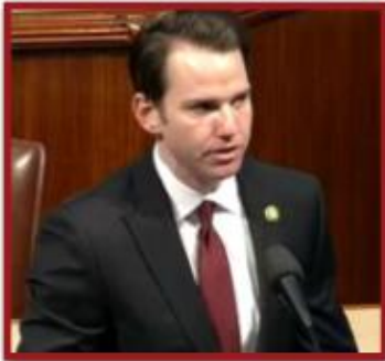
CA Congressman Kevin Kiley

4:00pm VIP Reception 5:00pm General Admission 6:00pm Dinner 6:30pm Program 8:00pm After Party