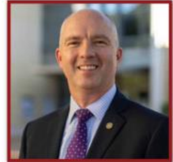
SLO County District Attorney Dan Dow

4:00pm VIP Reception 5:00pm General Admission 6:00pm Dinner 6:30pm Program 8:00pm After Party